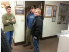
Boy critically hurt in ATV crash thanks medics who saved his life

( http://www.kval.com/news/local/Boy-critically-hurt-in-ATV-crash-thanks-medics-that-saved-his-life-238387571.html )