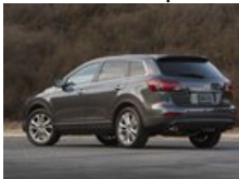
2013 Mazda CX-9: Road Test and Review Washington Post

( http://www.kval.com/news/local/Prison-for-man-accused-of-impersonating-a-police-officer-at-mall-238982881.html )