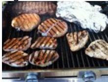
'Far more mutagenic than we previously understood'

( http://www.kval.com/news/local/Police-Knifepoint-wedding-attempt-ends-on-ground-at-gas-station-238012581.html )