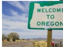
New Rule for Oregon Drivers Lifestyle Journal

( http://articles.washingtonpost.com/2013-08-17/news/41420811_1_fuel-tank-gasoline-price )