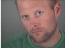
Prison for man accused of impersonating a police officer at mall

( http://www.kval.com/news/local/Far-more-mutagenic-than-we-previously-understood-238979161.html )