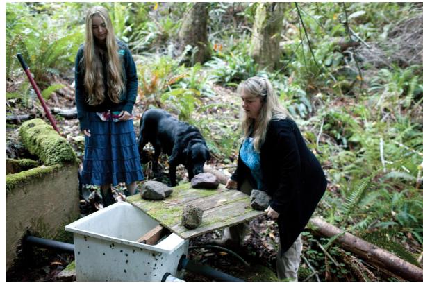
The people affected by this herbicide cocktail.›

“The whole thing, it feels like you’re being violated, you know? They (the state and the timber companies) obviously don’t care about us.”