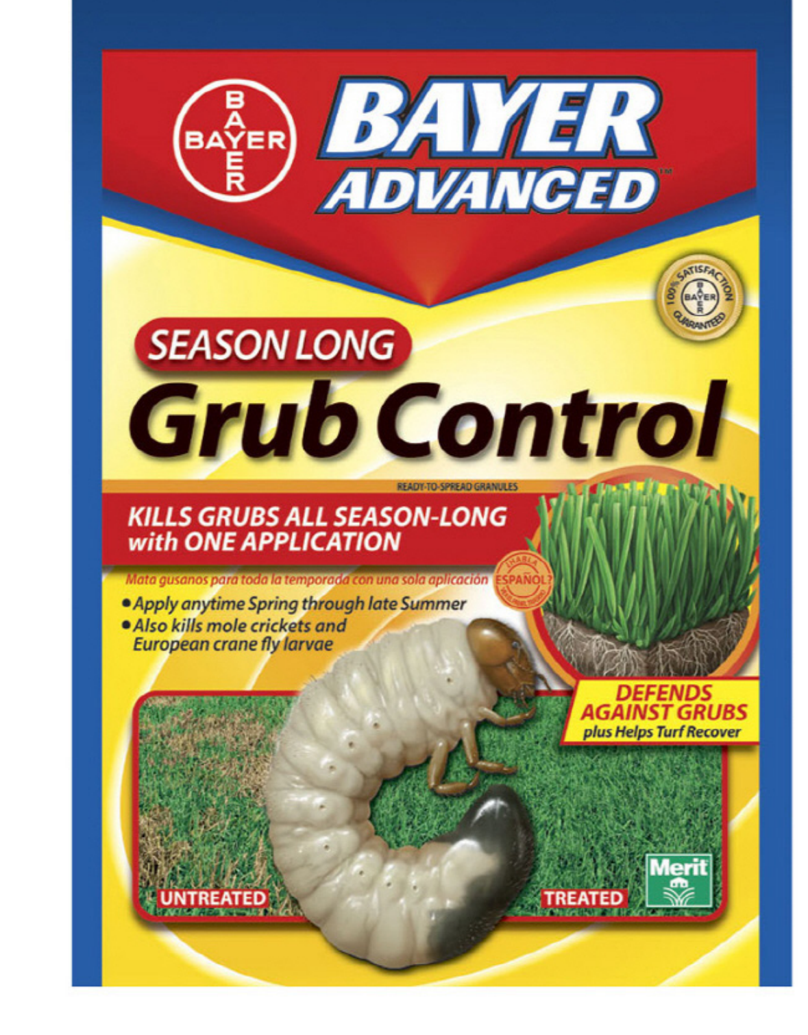
Active Ingredient: Imidacloprid

Neonicotinoids are a class of insecticides known to harm bees, hummingbirds, and other pollinators and beneficial insects that keep gardens healthy. Some neonicotinoids commonly found on store shelves include: Imidacloprid, Clothianidin, Acetamiprid, Thiamethoxam, Dinotefuran and Thiacloprid.