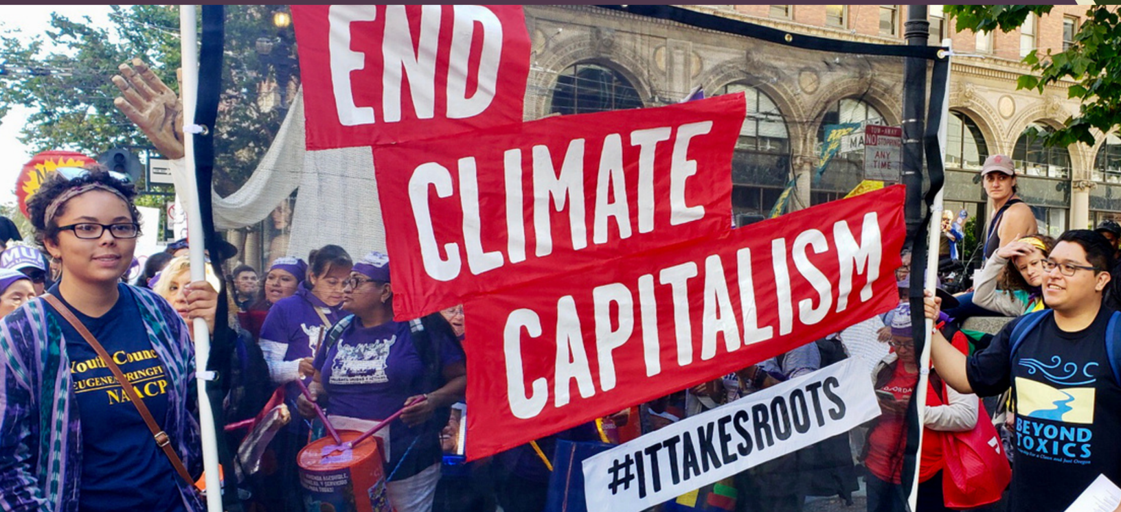
Above: Beyond Toxics staff and allies making a splash at the National People's Climate March.