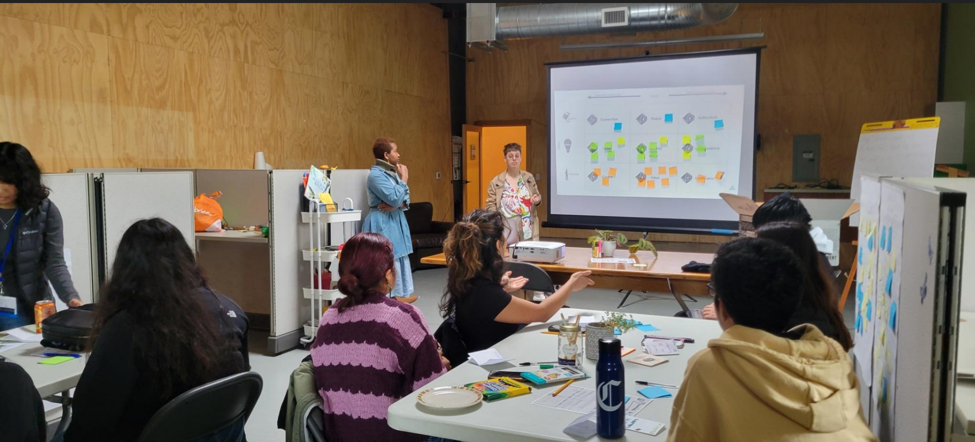
Brainstorming Activity: Students discussing Leadership qualities and the different roles to play in a movement.