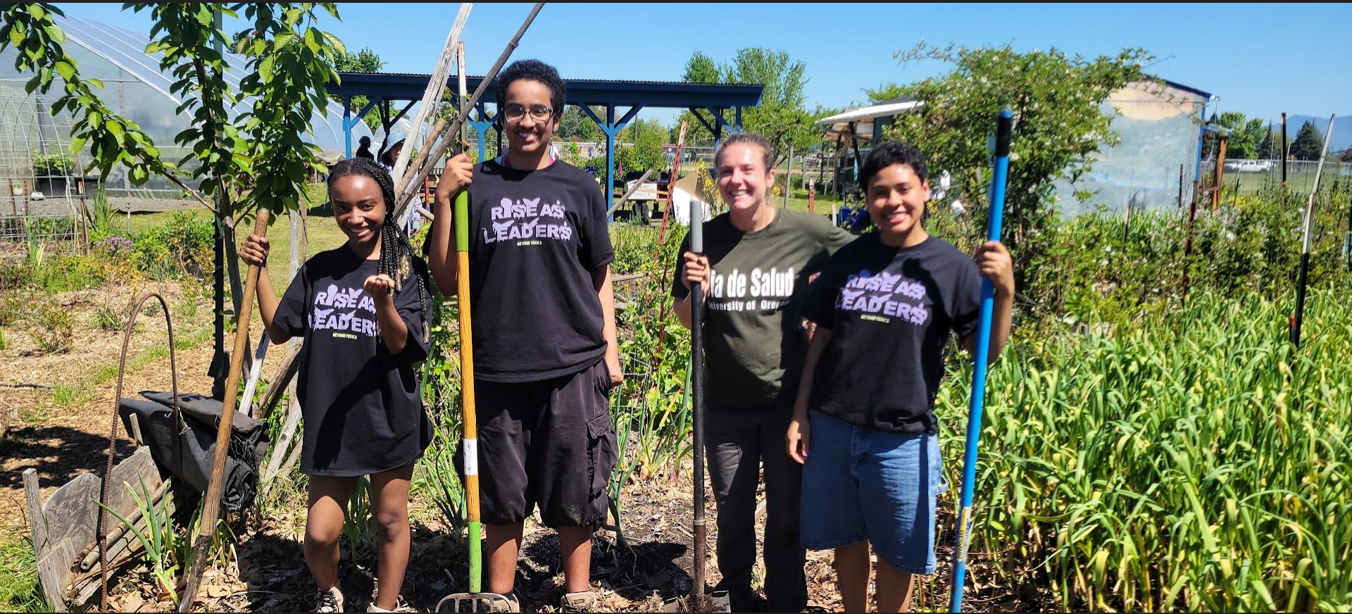
Exploring the wonders of organic farming and community gardening, so much to see and learn at Huerto de la Familia Community Garden!