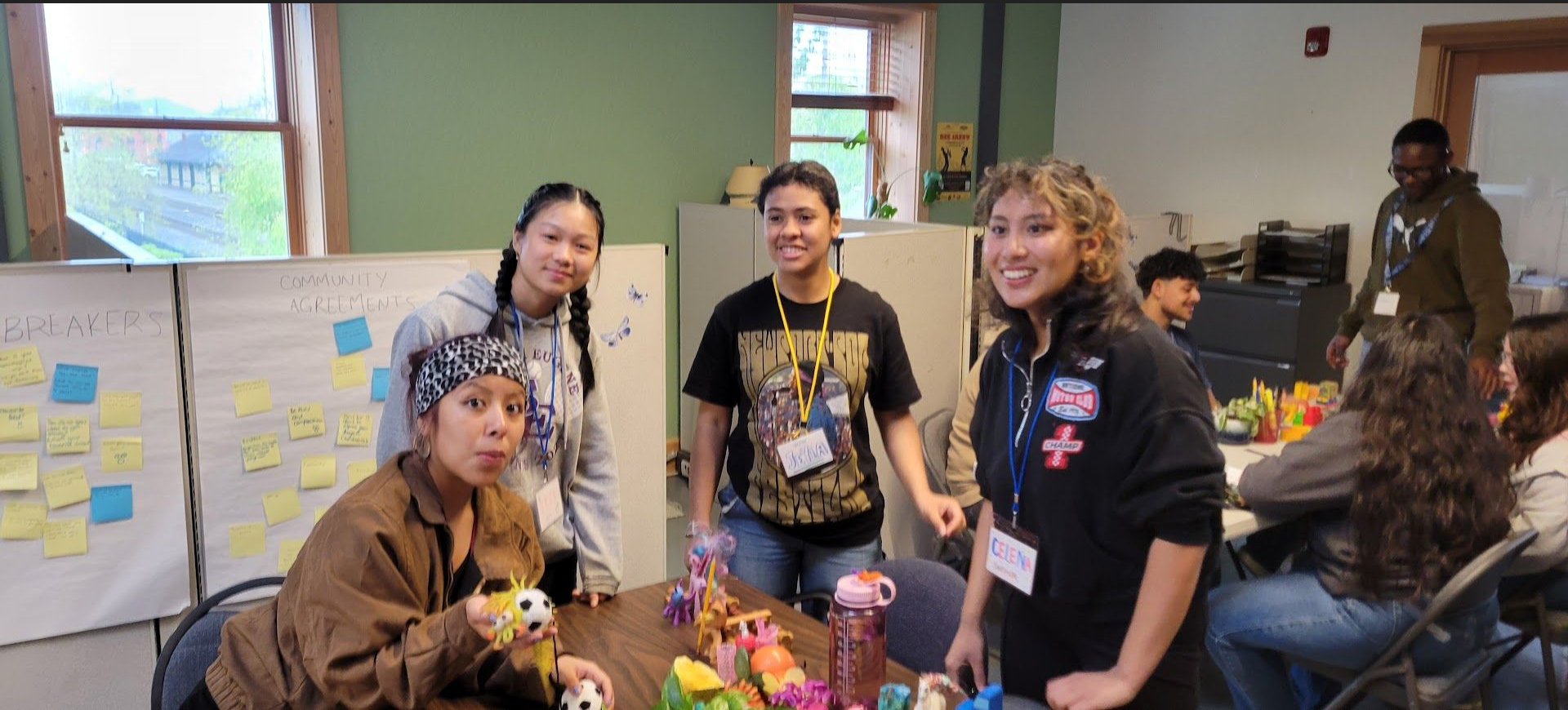
RAL students Showcasing their own sustainable city layout!