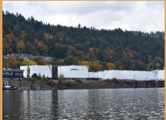
Beyond Toxics staff and partner organizations on a tour of the Critical Energy Infrastructure (CEI) Hub in Northwest Portland