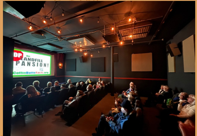
A full house at Darkside Cinema in Corvallis for the premiere of "Trash Town USA," a documentary about the Coffin Butte Landfill expansion and its consequences for the local community