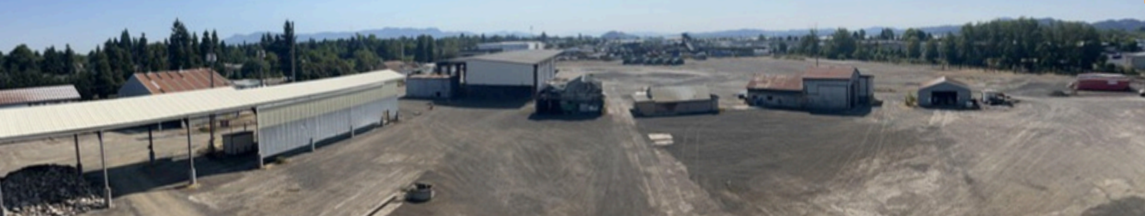
Above: the mostly empty J.H. Baxter site after recent demolitions.