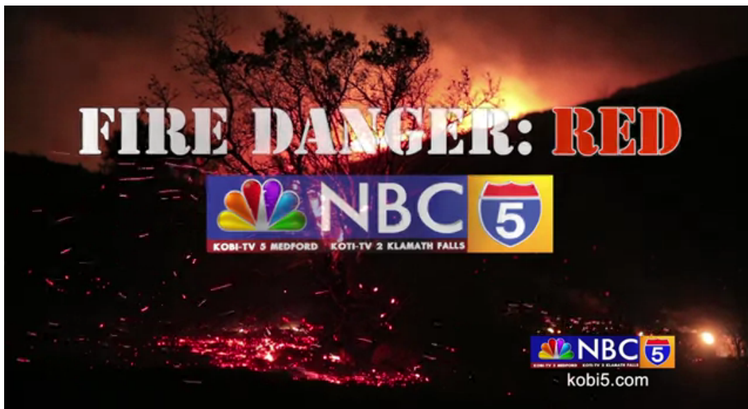
Advertisement (1 of 1): 0:09

MEDFORD, Ore. — With harvest fast approaching, agricultural employers are trying to keep farm workers safe during the pandemic.